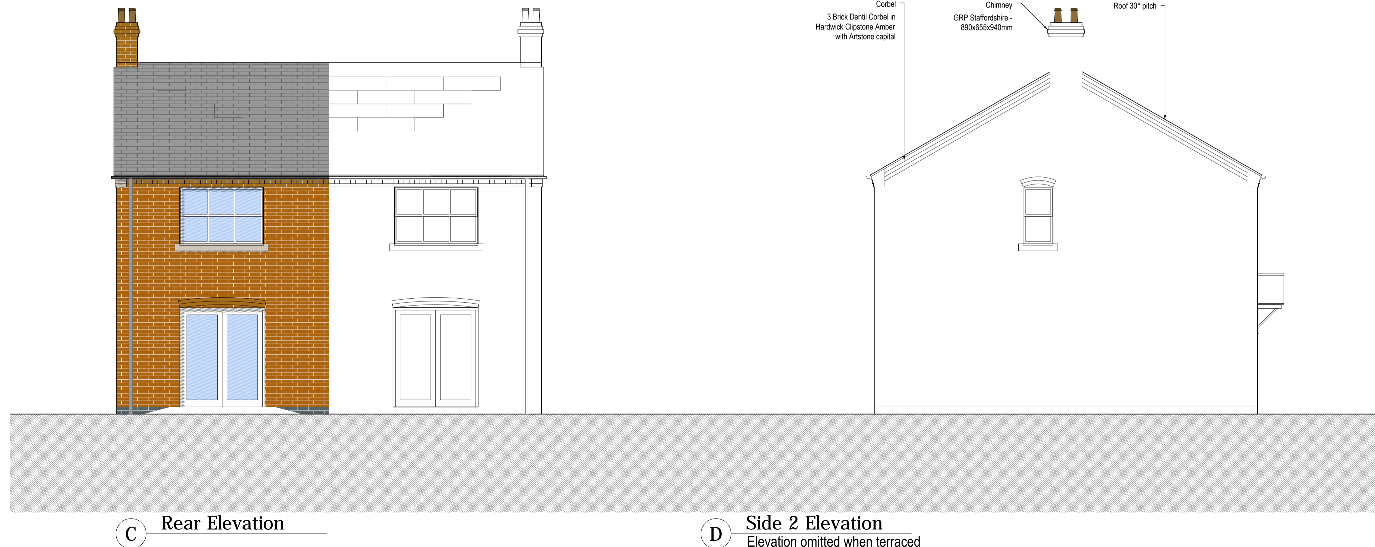
C Rear Elevation