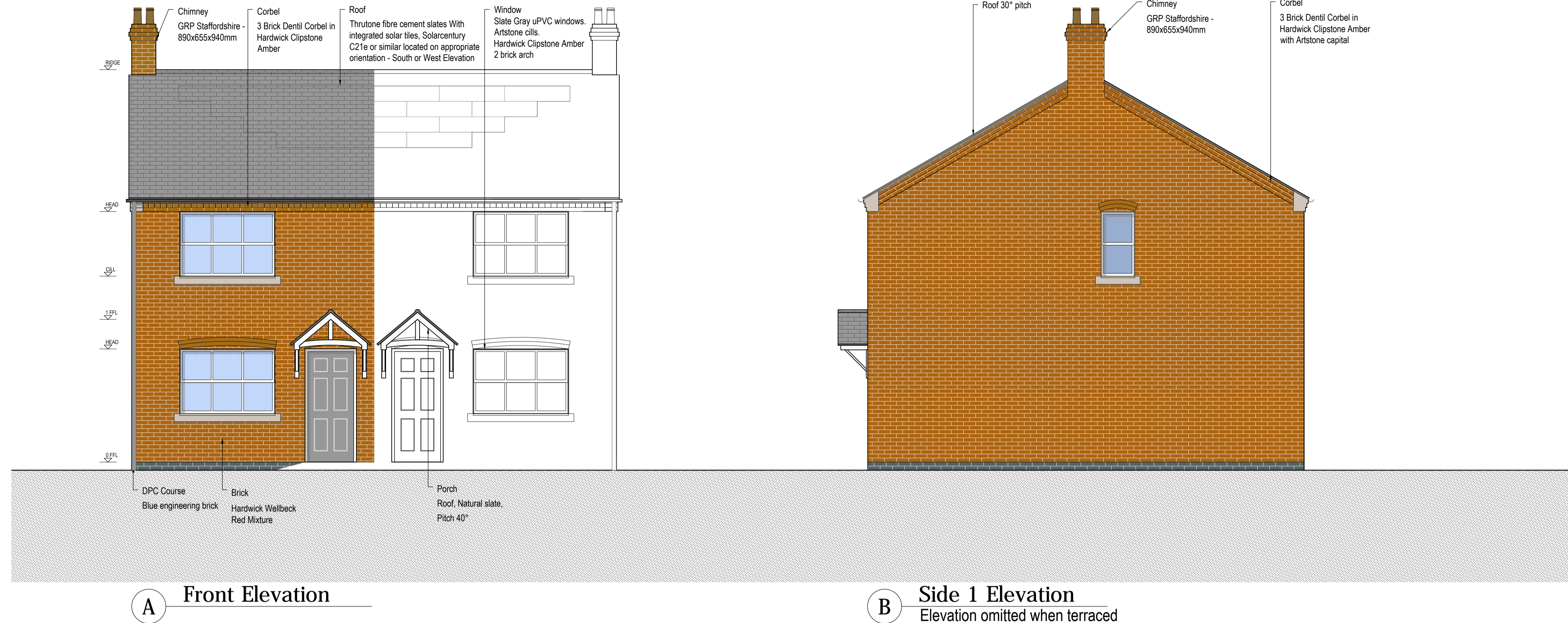
A Front Elevation